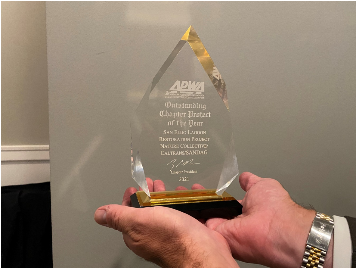
Project of the Year Award from APWA (September 2021)

The American Public Works Association (APWA) honored the San Elijo Lagoon Restoration as Project of the Year in 2021! The ongoing and momentous restoration project would not be possible without the work from SANDAG and Caltrans Build NCC, The Nature Collective , Marathon Construction, and the joint venture: Flatiron, Skanska, Stacy and Witbeck (FSSW). Together, the team is able to restore the lagoon, improve tidal flushing, enhance nesting areas for local wildlife and improve the overall health of the lagoon. Did you know a seal was spotted in the lagoon for the first time in decades? That is a great testament to the quality of work the Build NCC team has dedicated to restoring the San Elijo Lagoon. Don't fret, it's not over yet.