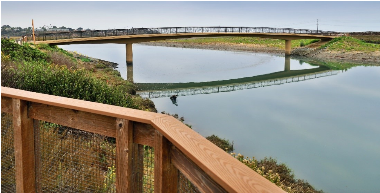
San Elijo Lagoon Pedestrian Bridge (August 2021)

As part of San Elijo Lagoon restoration projects, Caltrans and SANDAG Build NCC crews are transporting soil along North Rios Avenue in Solana Beach. Soil hauling efforts began on August 2 and continued through October 2021 to boost planting efforts and create new wildlife habitats.